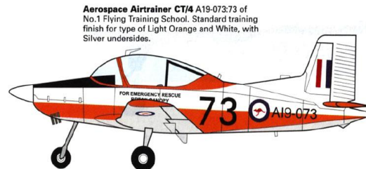
Aerospace Airtrainer CT/4 A19-073:73 of No.1 Flying Training School. Standard training finish for type of Light Orange and White, with Silver undersides.

If your dream is to be a Pilot in the Australian Defence Force (ADF), whether as a fast jet pilot in the Royal Australian Air Force, or rotary wing pilot in the Royal Australian Navy or Australian Army, one of our Defence Force Pilot Selection Training Courses is for you.