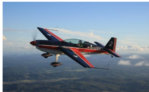
Figure 2 Our Extra 300

With close ties to serving ADF Pilots our course material is constantly updated to reflect the current ADF pilot selection requirements and we can put you in direct contact if you have any questions we can't answer, or if you just need sound advice from an active ADF pilot. Our ADF Flight Screening Prep.