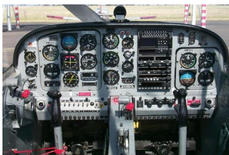
CT4 Instrument Panel