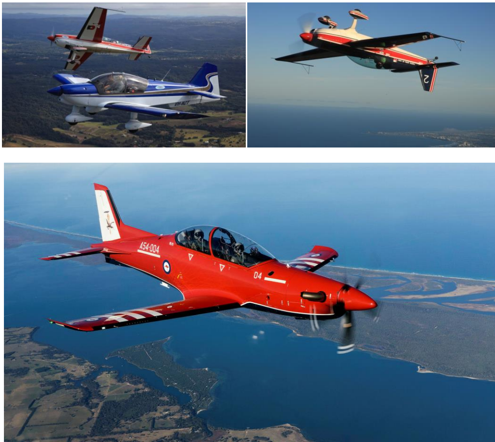
Figure 3 - The new PC 21 RAAF Advanced Trainer

Please understand that your 'motivation and commitment' to becoming a military pilot are critical. If you are not 100% sure that a career as an ADF Pilot is really what you want, the ADF Pilot Selection process will detect this and you will not be successful. We therefore recommend that if you have any doubts or are just 'giving it a shot' as one possible career path, please talk to us and do an assessment flight before applying to the ADF or signing up for any of our courses.