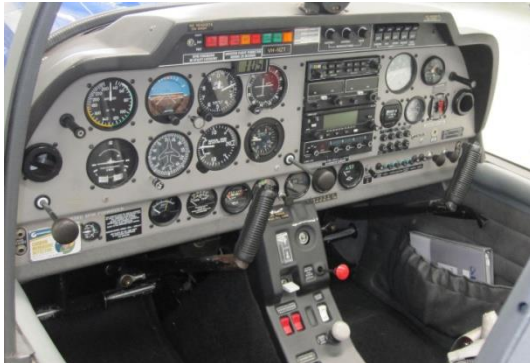
Figure 1 - Robin 2160 Instrument Panel

criteria is far more complex than assessing a candidate's aptitude or flying skills. We know the current selection criteria so we can help guide you through this process. One important factor that is often overlooked by ADF pilot applicants is the candidate's suitability to become a commissioned officer. When you join the ADF you are becoming an officer first, and a pilot second! Our course helps you assess your personal strengths and weaknesses and provides advice and insights into preparing yourself for the ADF Pilot Selection Agency Officer Selection Board (OSB) at the end of Flight Screening.